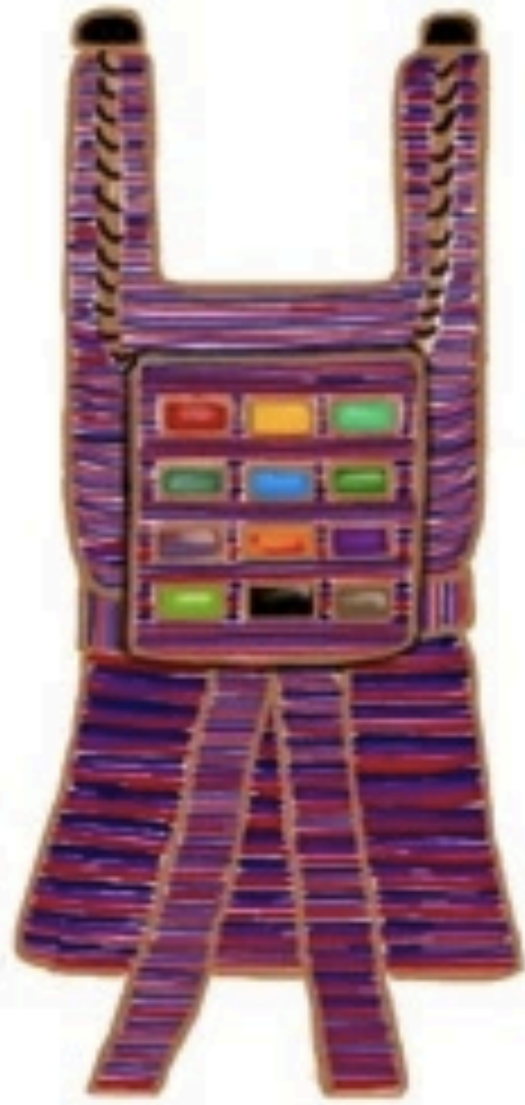
The Priestly Ephod